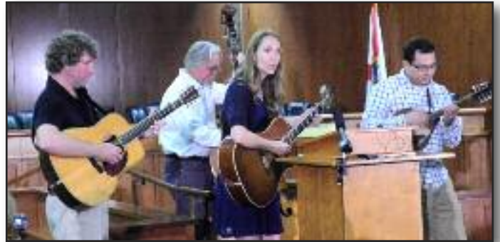
Belle and the Band performing at the Press Conference